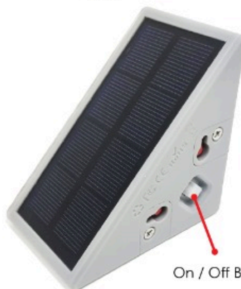
On / Off Button